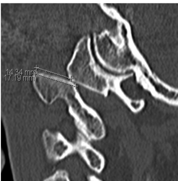
Figure 1. Measurement of AAI.